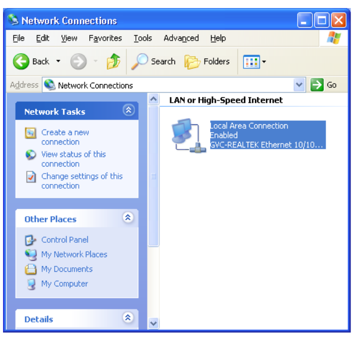
Figure 3. The Network Dialog